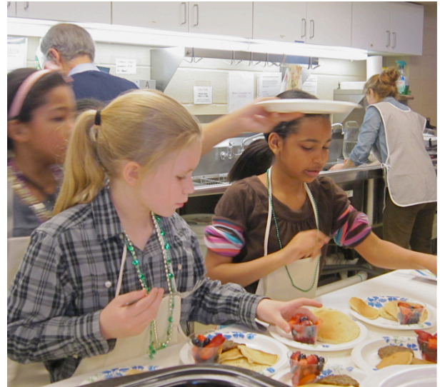
A Successful Pancake Feed earned $1000 for Youth Mission Trips this Summer!