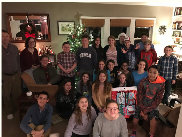
Youth Group Christmas Party 2018

Your 2018 contribution reports for both the General Stewardship and Legacy Campaigns will be available in late January. Look for them in the Narthex. Thank you to all who have contributed. Please continue to use your envelopes in 2019 as it makes it much easier for the counters and pledge secretaries to track and record your payments.