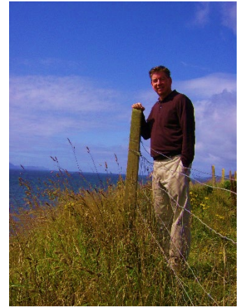
In Ireland during my doctoral program